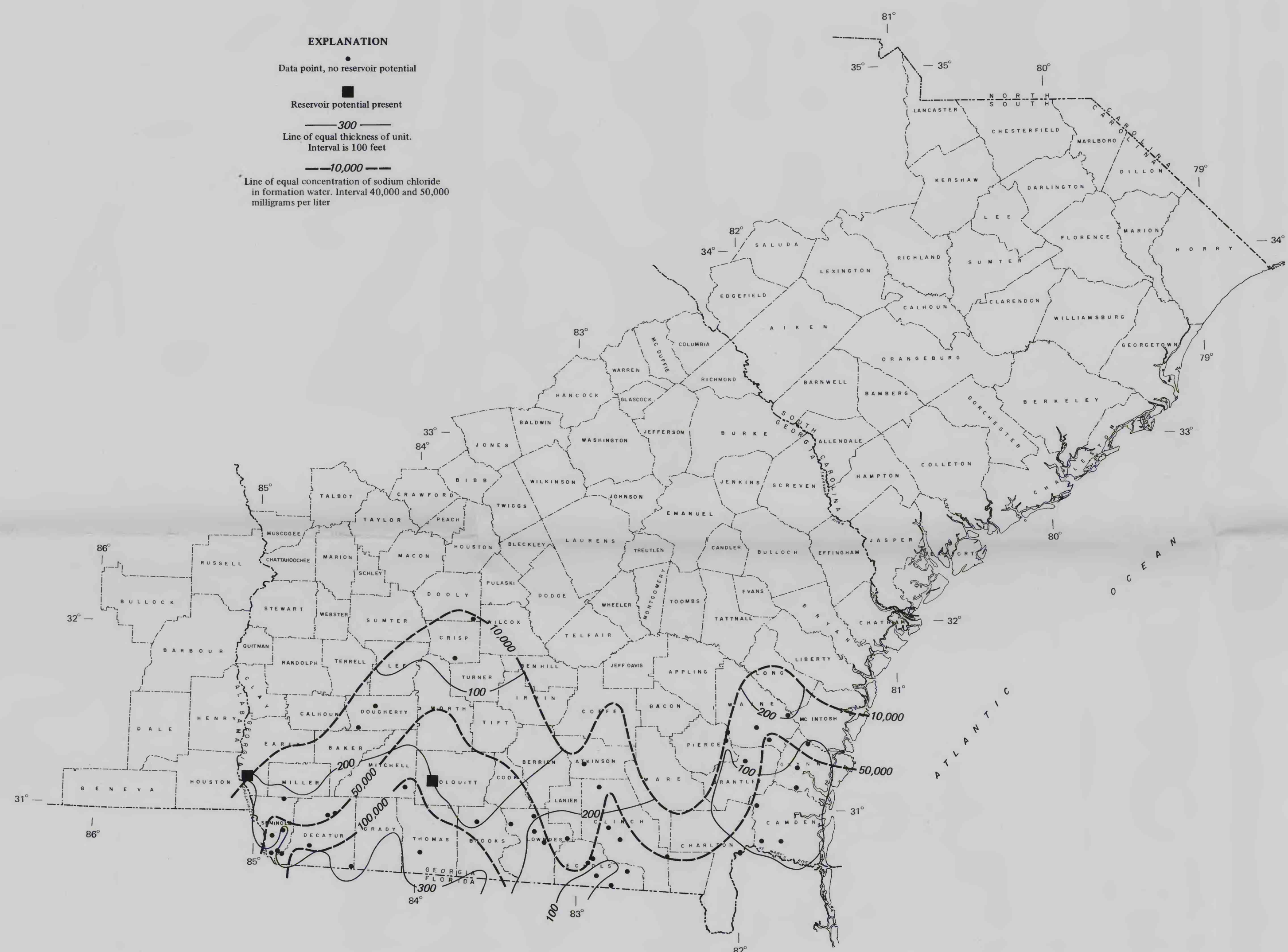
B. THICKNESS AND SODIUM CHLORIDE CONCENTRATION OF UNIT E IN AREA OF NON-USEABLE GROUND WATER