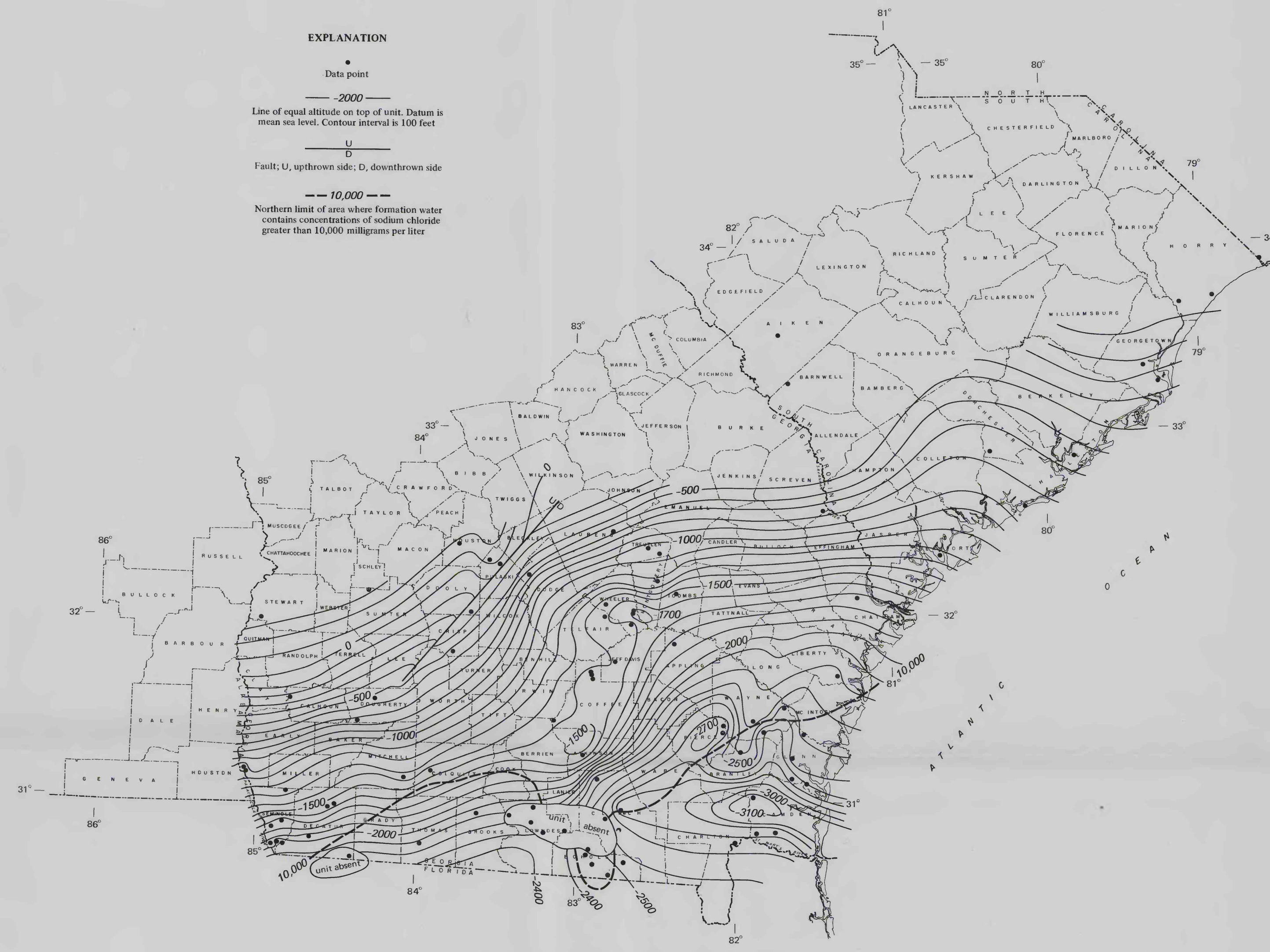
A. STRUCTURAL TOP OF UNIT A