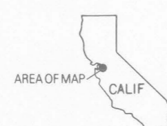
MAPS SHOWING THE DAVILLA HILL EARTH-FLOW COMPLEX, ALAMEDA COUNTY, CALIFORNIA