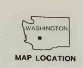
BASAL AND SURFACE CONTOURS OF RADAR-MEASURED GLACIERS ON MOUNT RAINIER, WASHINGTON