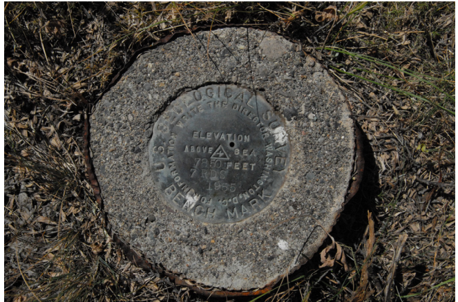
Close up of bench mark.