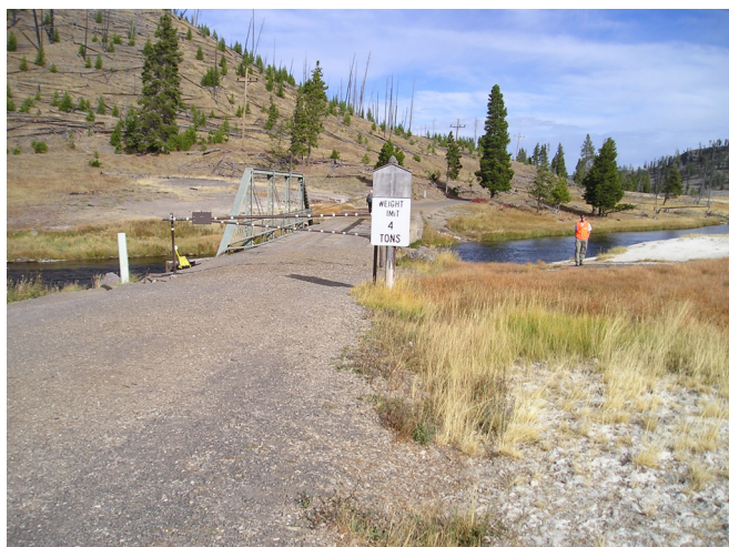
Looking northwest along trail at old bridge over Firehole River, bench mark THERMAL (beneath person) and bench mark C10 (beneath yellow GPS unit).

DESCRIPTION Proceed 11.5 mi south along the Madison-West Thumb highway Madison Junction (or 4.3 mi north of the Old Faithful overpass), thence 0.2 km (0.10 mi) northwest along a paved road signed “Fairy Falls.” Bench mark is in an exposed area of bedrock along the east bank of the Firehole river, 13.1 m (43.0 ft) east-northeast of bench mark C10, 10.9 km (6.75 mi) north of the north end of a pipe barricade, 9.1 m (29.9 ft) northeast of the centerline of the road, 6.8 m (22.3 ft) southeast of the southeast end of a bridge, and about level with the road. Note that the bench mark is in the middle of a small thermal spring, and acidic waters have etched the face of the bench mark, making it impossible to make out the stamping.