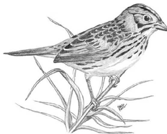
Henslow’s Sparrow.