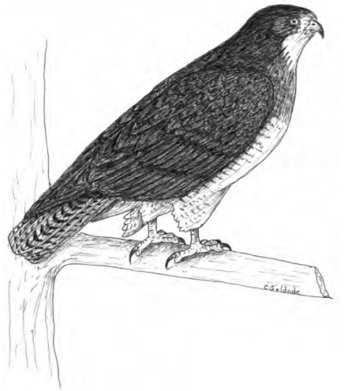
Swainson’s Hawk. Illustration by Christopher M. Goldade, U.S. Geological Survey.

Swainson’s Hawks prefer open grasslands with scattered trees or with small clumps of trees or shrubs (Bent, 1961; Bechard and others, 2010; Kennedy and others, 2014), sometimes near cultivated areas (Schmutz, 1987, 1989). The species uses shortgrass, mixed-grass, tallgrass, and sandhill prairies; aspen parklands; riparian areas; isolated trees; shelterbelts; woodlots; black-tailed prairie dog ( Cynomys ludovicianus ) colonies; pastures; hayland; cropland; and residential areas (Saunders, 1914; Bent, 1961; Jacobson, 1972; Stewart,