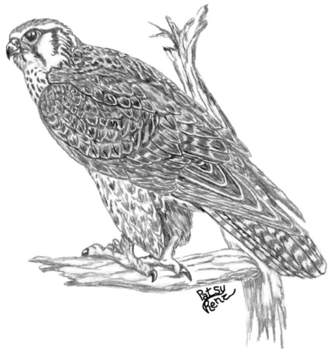
Prairie Falcon.