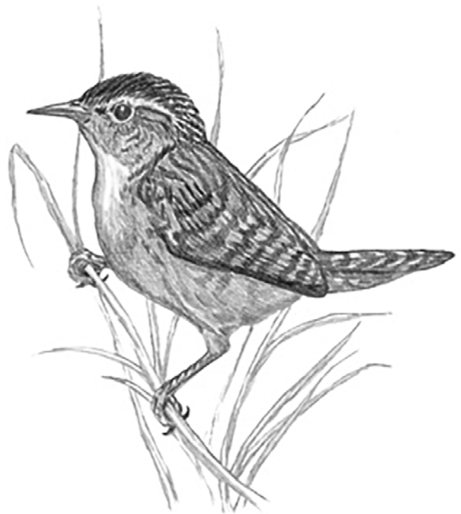
Sedge Wren. Illustration by Patsy D. Renz, used with permission.

Sedge Wrens breed in North and South America; there are 19 recognized subspecies of Sedge Wren, including 1 in North America, 8 in Mexico and Central America, and 10 in South America (Robbins and Nyári, 2014). This account will focus on the North American subspecies ( Cistothorus stellaris stellaris ). In North America, the species breeds from eastern Saskatchewan through southern Manitoba and southern Ontario to southern Maine and New Brunswick; south from northeastern Montana and central North Dakota, through eastern South Dakota, to eastern Kansas and eastern Oklahoma; and east to New Jersey, Rhode Island, and New Hampshire (National Geographic Society, 2011). The relative densities of Sedge Wrens in the United States and southern Canada, based on North American Breeding Bird Survey (BBS) data (Sauer and others, 2014), are shown in figure V1 (not all geographic places mentioned in report are shown on figure).