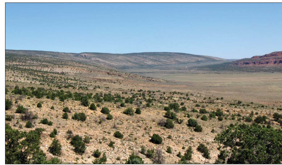
View looking north into House Rock Valley along the east Kaibab Monocline.