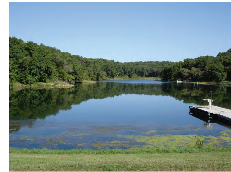
Springbrook Lake in Guthrie County, Iowa.

Any use of trade, product, or firm names is for descriptive purposes only and does not imply endorsement by the U.S. Government.