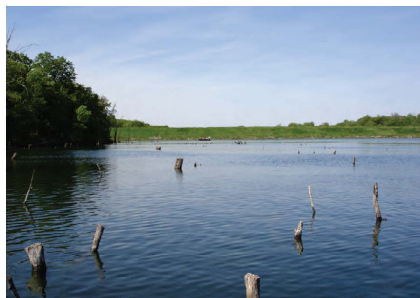
Yellow Smoke Lake in Crawford County, Iowa (photograph by Aimee Donnelly, U.S. Geological Survey).

Any use of trade, product, or firm names is for descriptive purposes only and does not imply endorsement by the U.S. Government.