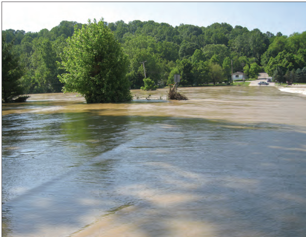
Photos taken in Spencer, Indiana, in June 2008.