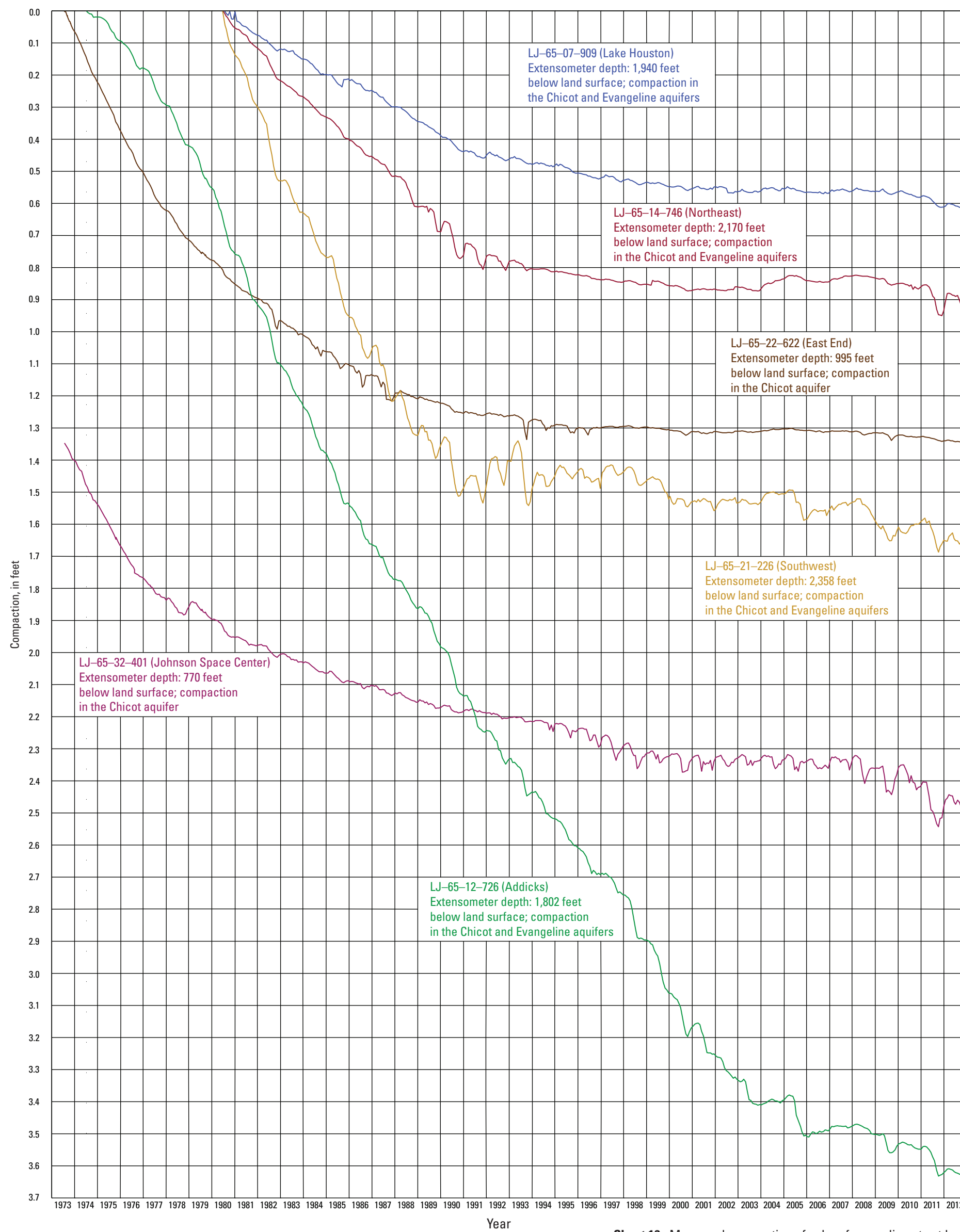
Sheet 16. Measured compaction of subsurface sediments at borehole-extensometer sites depicted on sheet 15, 1973–2012.