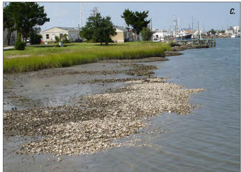
Figure 2. Photographs of shoreline stabilization projects in North Carolina that illustrate the living shoreline approach (A) Project to replace failing seawall includes fill, marsh transplanting, and rock sill; 2 years post-construction. (B) Project to protect marsh edge, which included rock sill, no fill, and minimal transplants; 4 years post-construction. A drop-down in the sill provides marsh access to nekton. Oysters can be seen colonizing the lower rock surfaces. (C) Project to protect eroding sandy beach includes only natural habitats, achieved with salt marsh transplants and oyster reef restoration; 4 years post-installation.