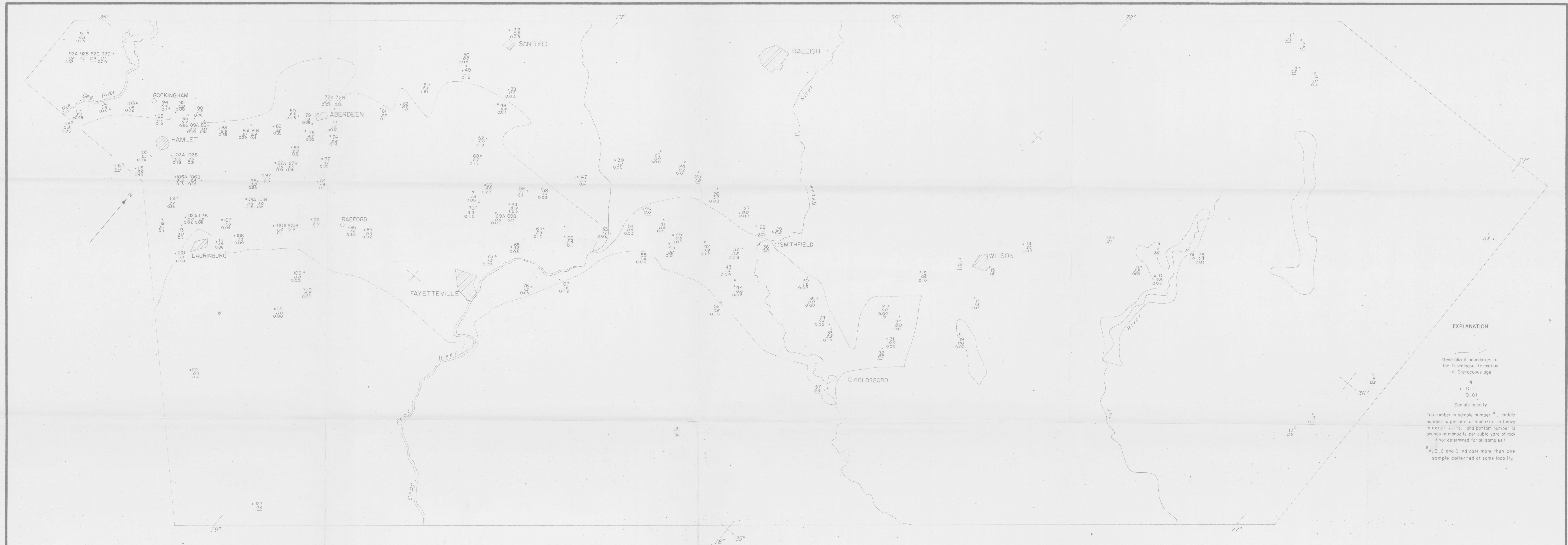
FIGURE 2.—LOCATION AND MONAZITE CONTENT OF SAMPLES IN PART OF THE COASTAL PLAIN OF NORTH CAROLINA.