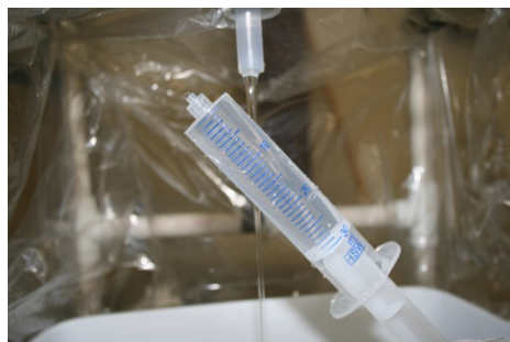
Figure 5.2.2.B–3. Groundwater flowing into a processing chamber is used to rinse the syringe casing.