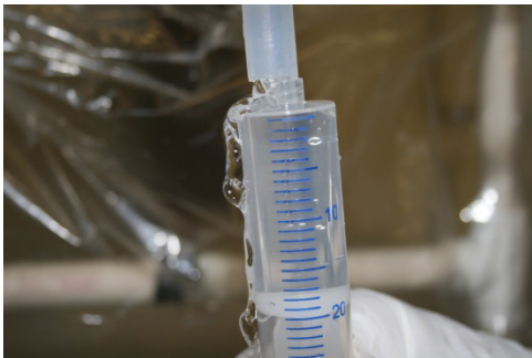
Figure 5.2.2.B-5. Groundwater flowing directly into a syringe.