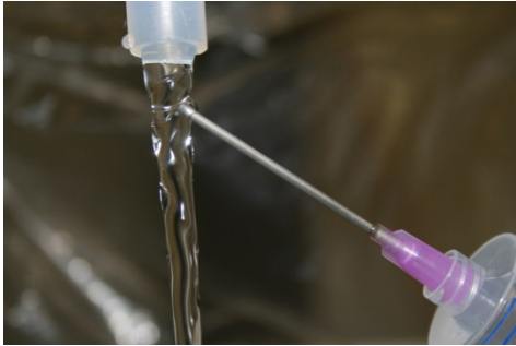
Figure 5.2.2.B-4. Use the bore needle to obtain groundwater for rinsing and conditioning the bore needle and syringe. (Photograph taken inside a sample-processing chamber by Michael Manning, U.S. Geological Survey.)