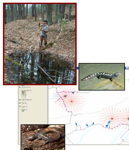
Biological surveys, field mapping, and spatial analysis of pond habitats in Delaware Water Gap NRA are being used to determine population status, breeding habitat usage, and potential threats to pond breeding amphibians from near park development. (PI: Snyder, Young)

LSC seeks to expand our partnerships within the USGS and DOI, and to develop and apply landscape ecology approaches to the benefit of all our research partners.