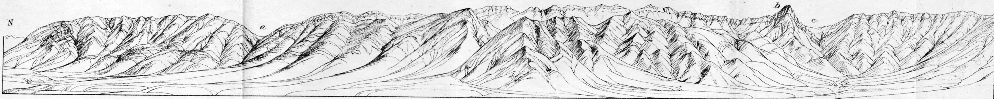
a, Flathead Pass. Carboniferous Strata form the Summit of the Range. Dipping 20 to 90° E. b, Liberty Peak. c, Union Pass. 9000 ft.