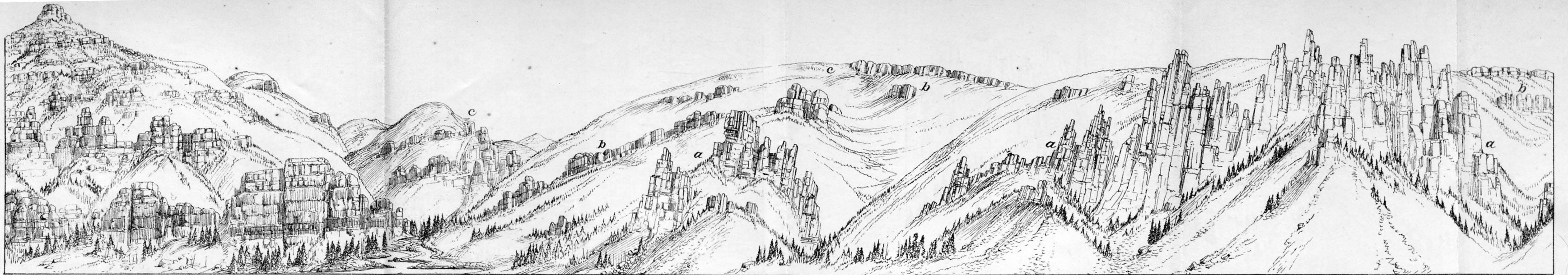
Gallatin River Cañon No. 3.

a, a. Schists, overlaid by Silurian and Carboniferous beds b, b. c, c. (3 miles.)