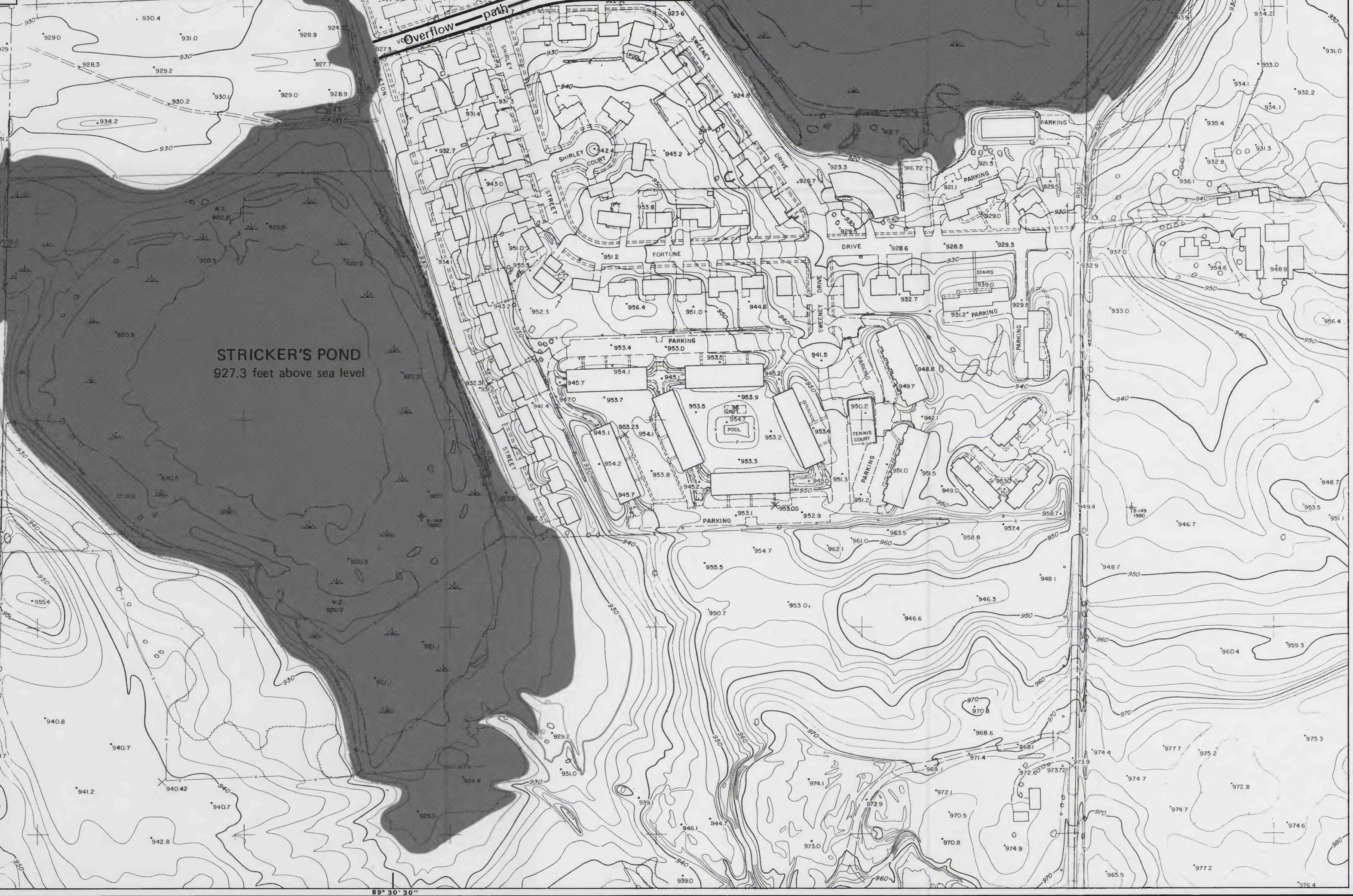
Peak daily mean stage at Tiedeman's, Stricker's, and Esser's Ponds, Middleton, Wisconsin, for the 100-year recurrence interval rainfall record (April 15 - November 5).

EXPLANATION Extent of peak daily mean pond stage for the 100-year rainfall (April 15 - November 5)