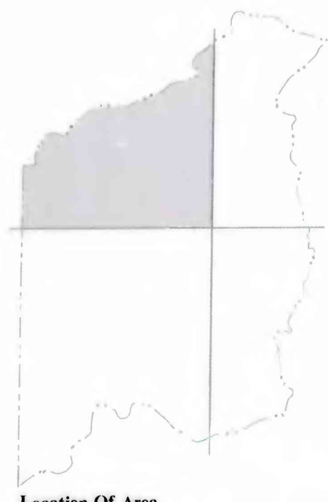
Location Of Area