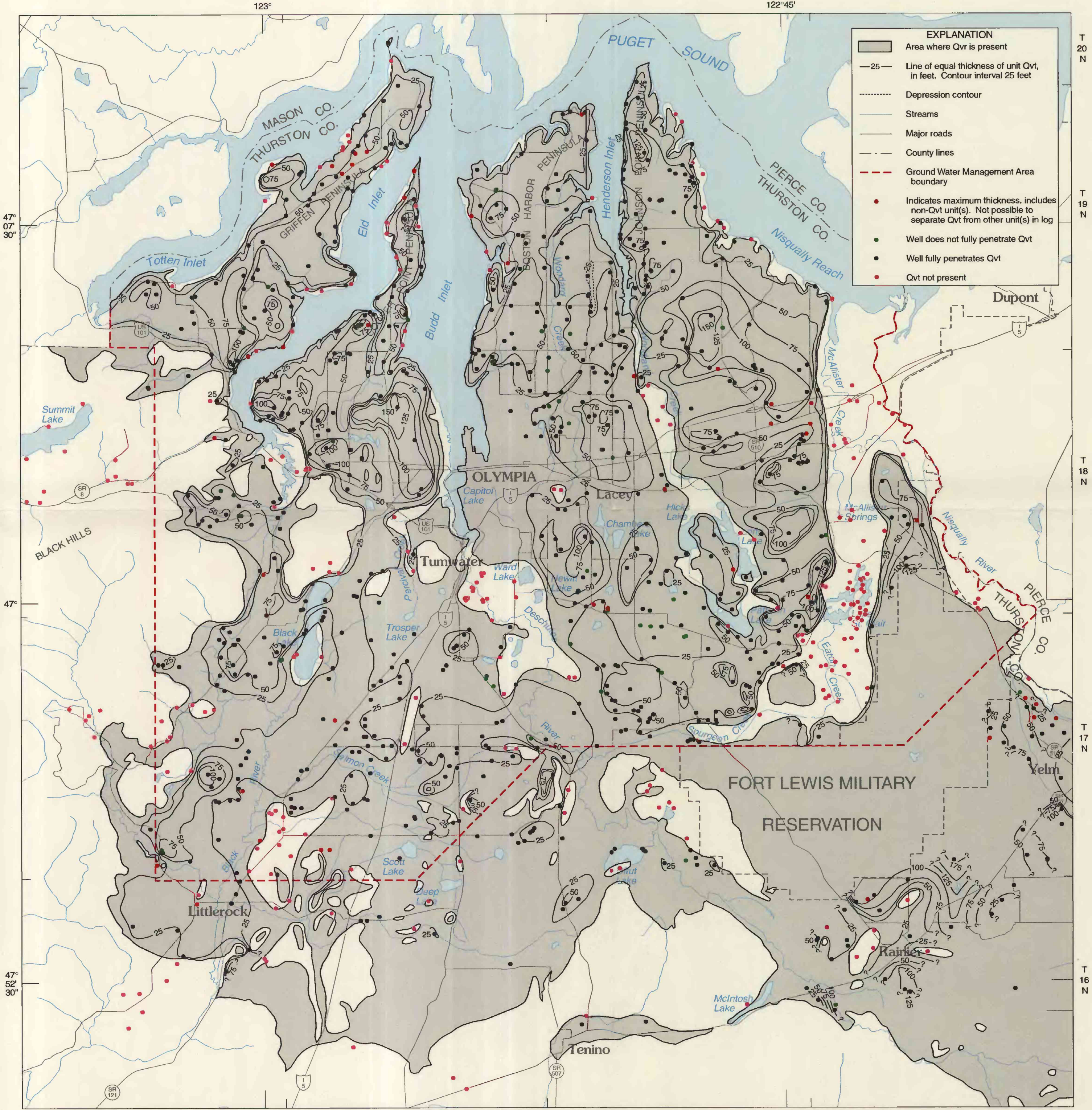
b. Extent and Thickness of Geohydrologic Unit Qvt