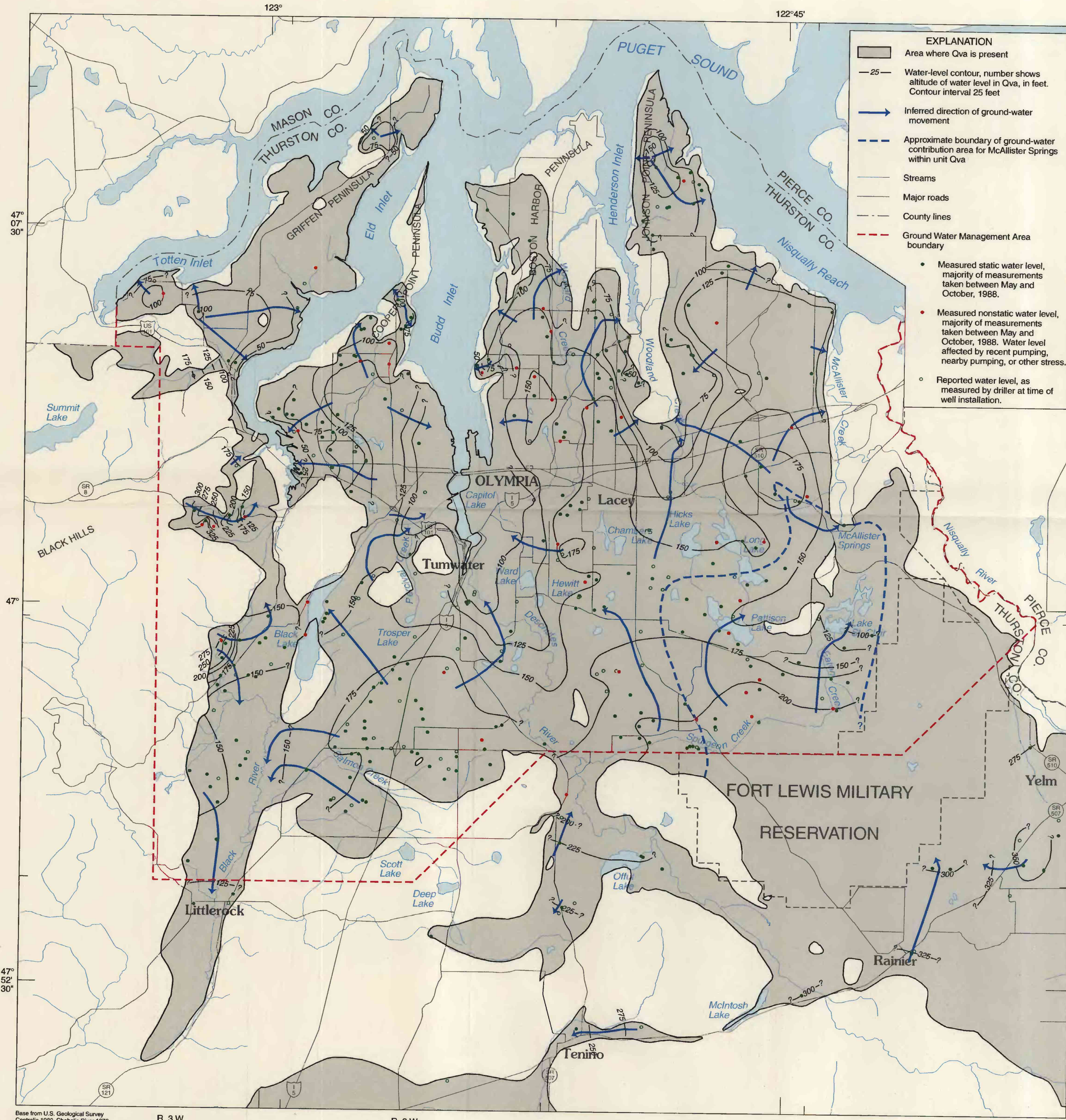
a. Water Levels and Flow Directions in Geohydrologic Unit Qva, 1988