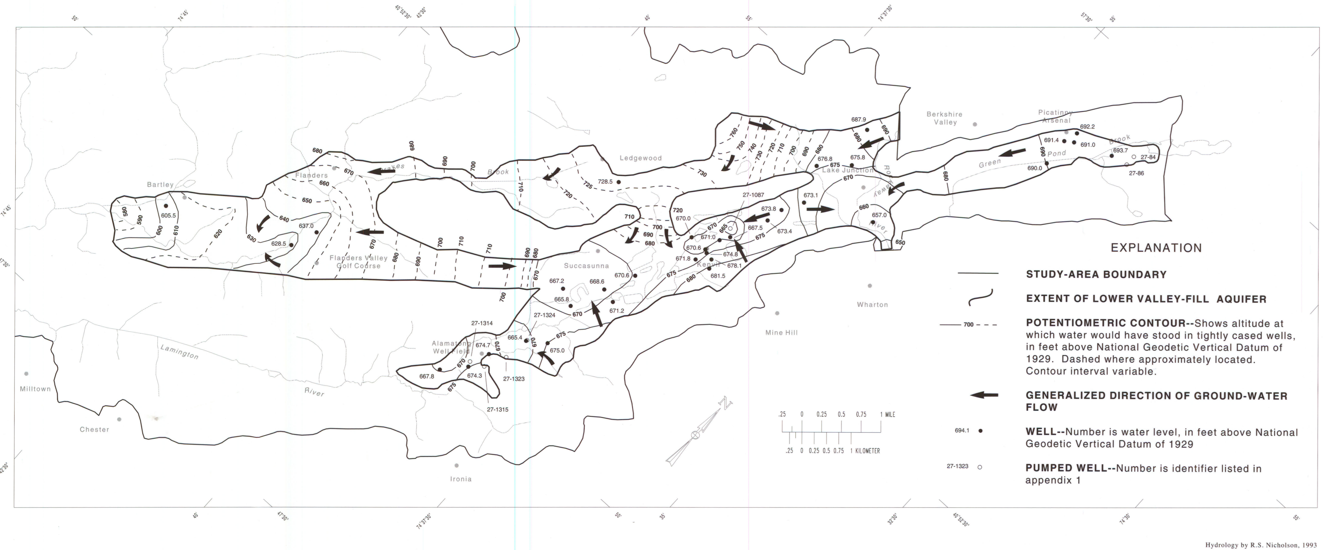
2c. Observed average potentiometric surface of and generalized directions of ground-water flow in the lower valley-fill aquifer, 1988-89.