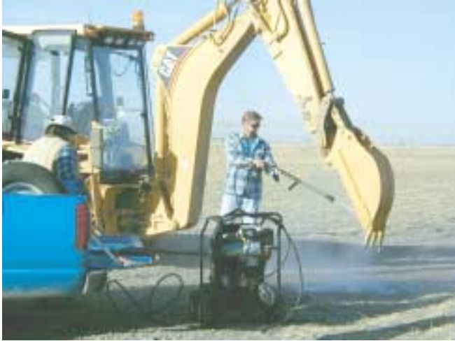
Figure 4. Backhoe blade being cleaned with a hot-water, high-pressure sprayer, October 1999, Fort Hall, Idaho

high-pressure sprayer before each trench was dug (fig. 4). Trenches were dug to a depth of about 3.5 to 4 ft; the face at the front edge of the trench was relatively vertical (fig. 5). Global Positioning System (GPS) measurements were made at trench sites to document locations of the trenches. Trenches were constructed in approximately the same areas as for earlier sampling events (but not the same locations) in an effort to duplicate soil conditions while avoiding use of previously disturbed soil.