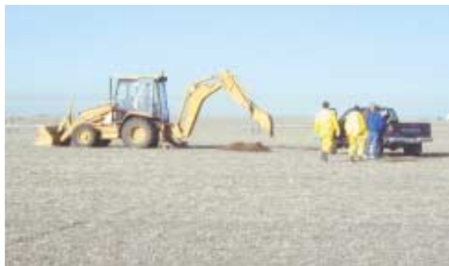
Figure 2. Backhoe constructing a soil sampling trench, October 1999, Fort Hall, Idaho.

In September 1999, personnel from the Shoshone-Bannock Tribes Agricultural Resources office and the NRCS (Idaho Falls) chose locations for soil sample collection. Choices for locations were based primarily on history of pesticide and cropland uses, variety of soil types, accessibility during fall and winter months, and landowner permission. Initially, four areas were