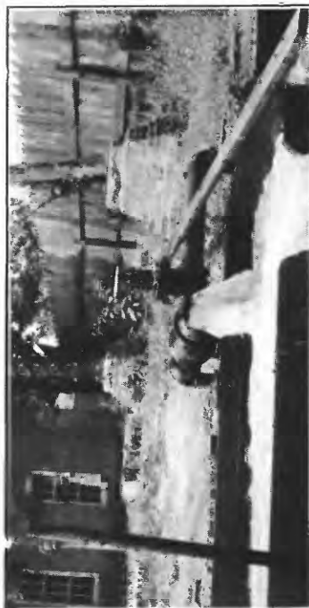
C. FLOWING WELL, 642 FEET DEEP, OF LOVE WAGON CO., DURANT, HOLMES COUNTY