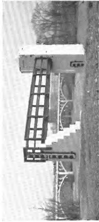
C. CONGAREE RIVER AT COLUMBIA, S. C.