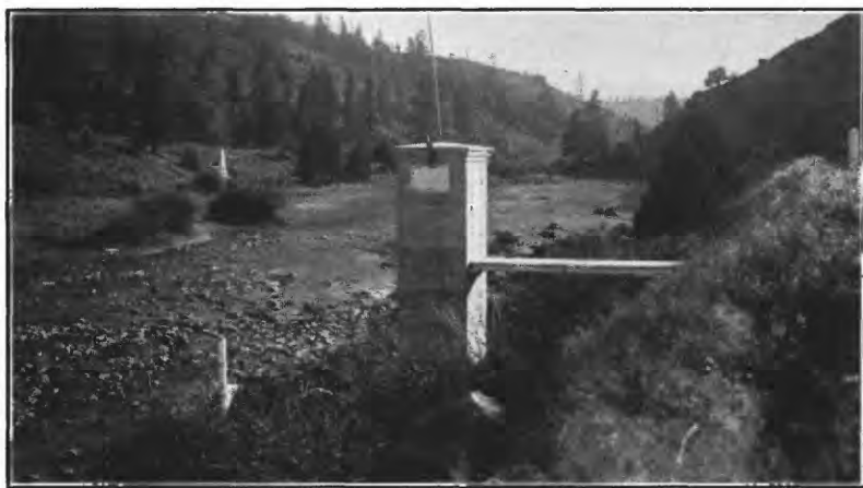
B. PIT RIVER NEAR CANBY, CALIF.