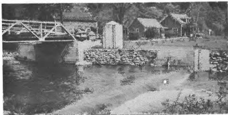
A. OTTER BROOK NEAR KEENE, N. H.