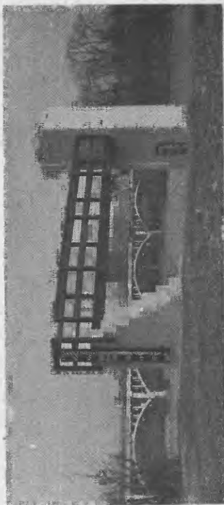
C. CONGAREE RIVER AT COLUMBIA, S. C.