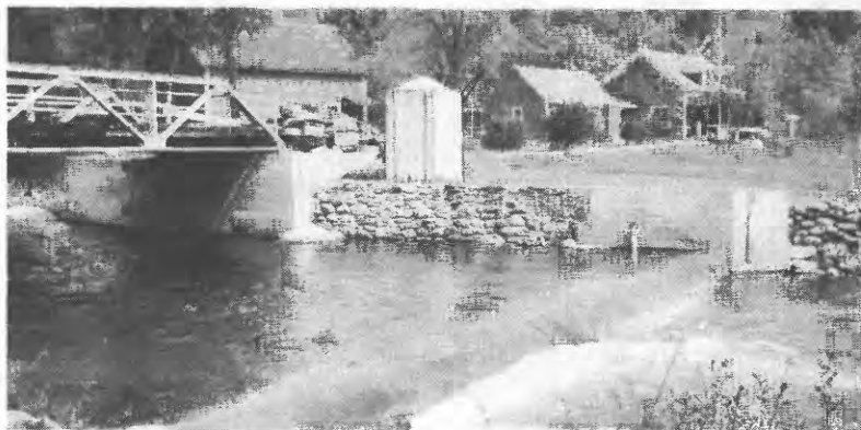
A. OTTER BROOK NEAR KEENE, N. H.