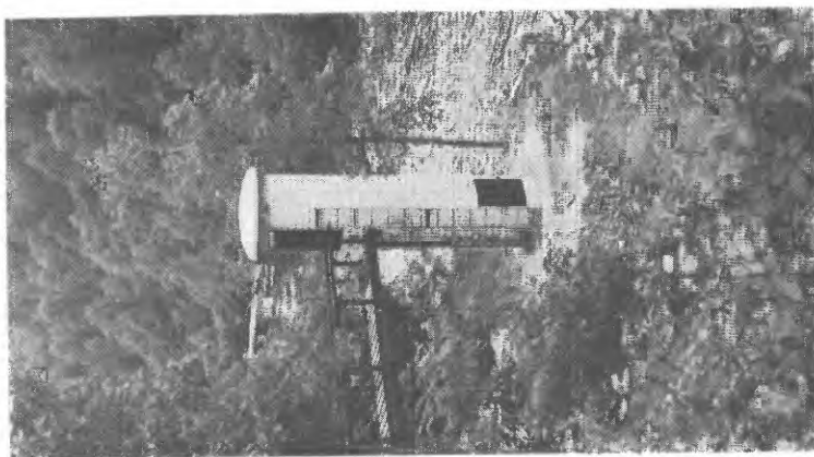
C. Nantahala River near Rainbow Springs, N. C.