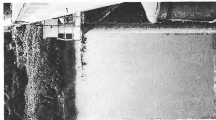
A. Wabash River at Delphi, Ind.