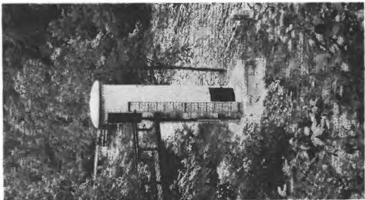
C. Nantahala River near Rainbow Springs, N. C.