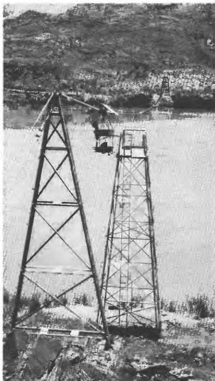
A. COLORADO RIVER AT LEES FERRY, ARIZ.