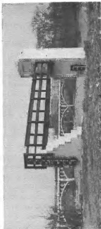
C. CONGAREE RIVER AT COLUMBIA, S. C.