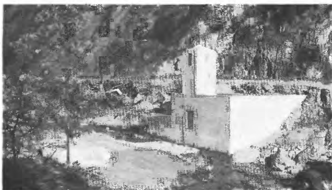
A. FISH CREEK NEAR DUARTE, CALIF.