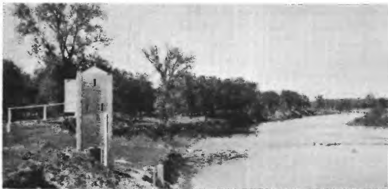
A, Minnesota River near Carver, Minn.