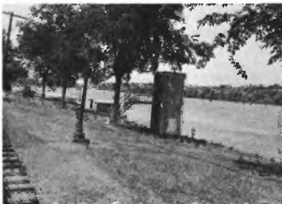
C, Mississippi River at McGregor, Iowa