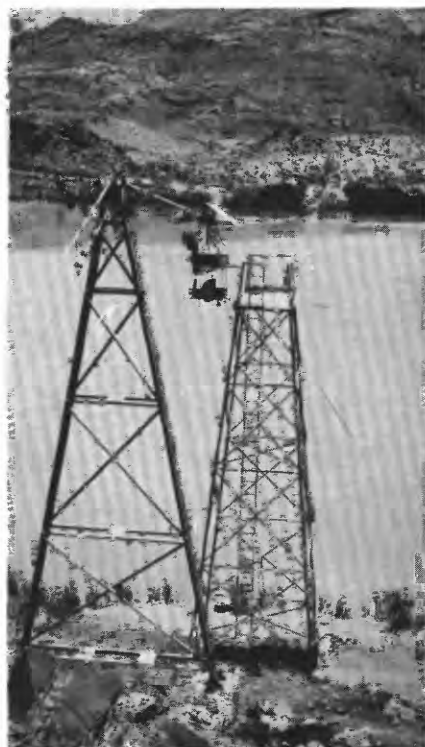
A. COLORADO RIVER AT LEES FERRY, ARIZ. Note landing tower.