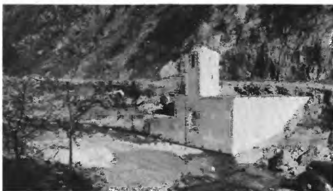
A. FISH CREEK NEAR DUARTE, CALIF.