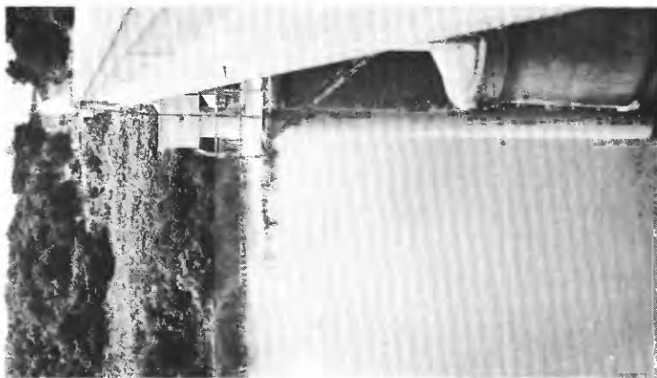
C. Wabash River at Delphi, Ind.