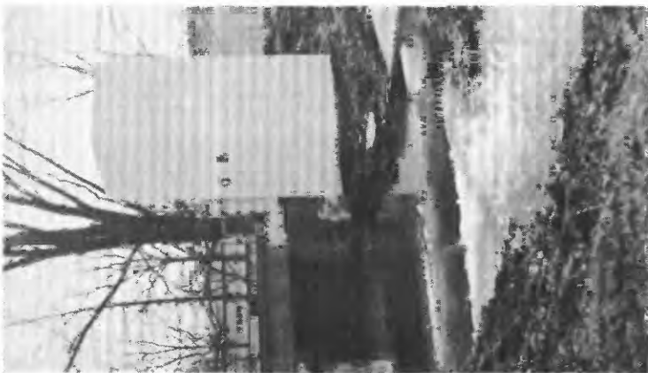
B. Cave Creek near Fort Spring, Ky.