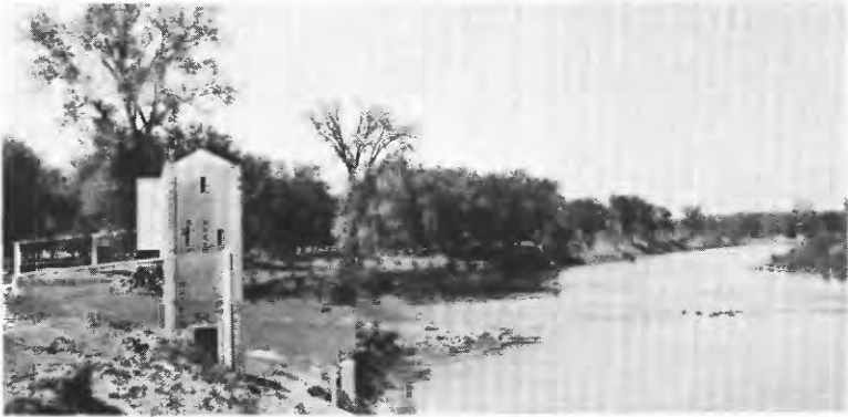
A, Minnesota River near Carver, Minn.