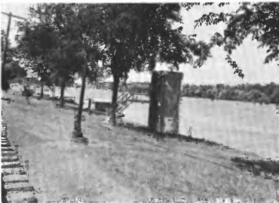
C, Mississippi River at McGregor, Iowa