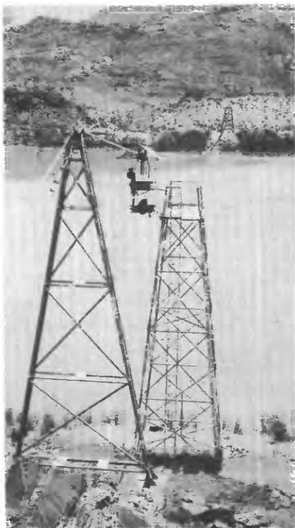
A. COLORADO RIVER AT LEES FERRY, ARIZ.