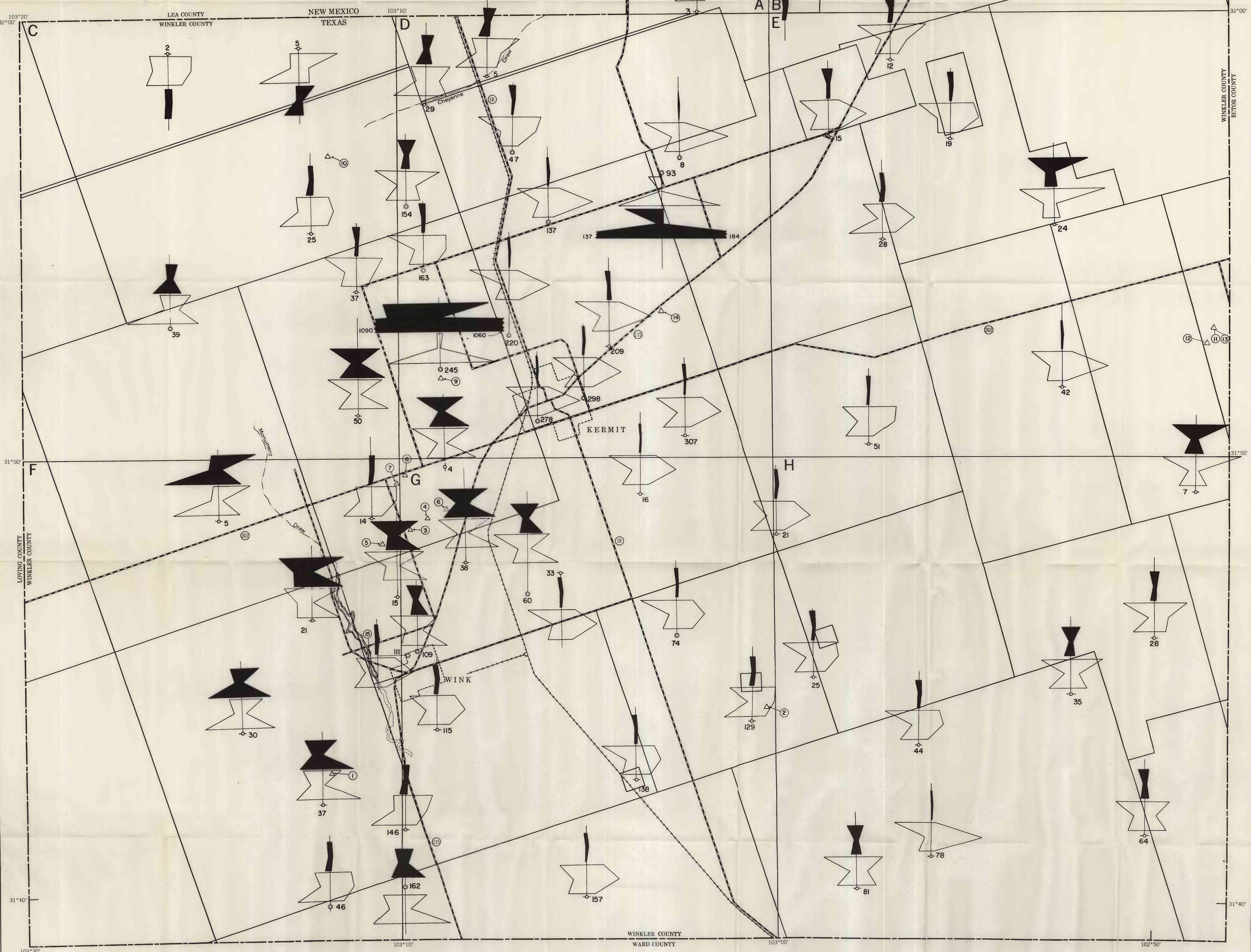
MAP OF WINKLER COUNTY, TEXAS, SHOWING RELATIONS OF PRINCIPAL IONS IN WATER FROM SELECTED WELLS TAPPING THE CENOZOIC ALLUVIUM