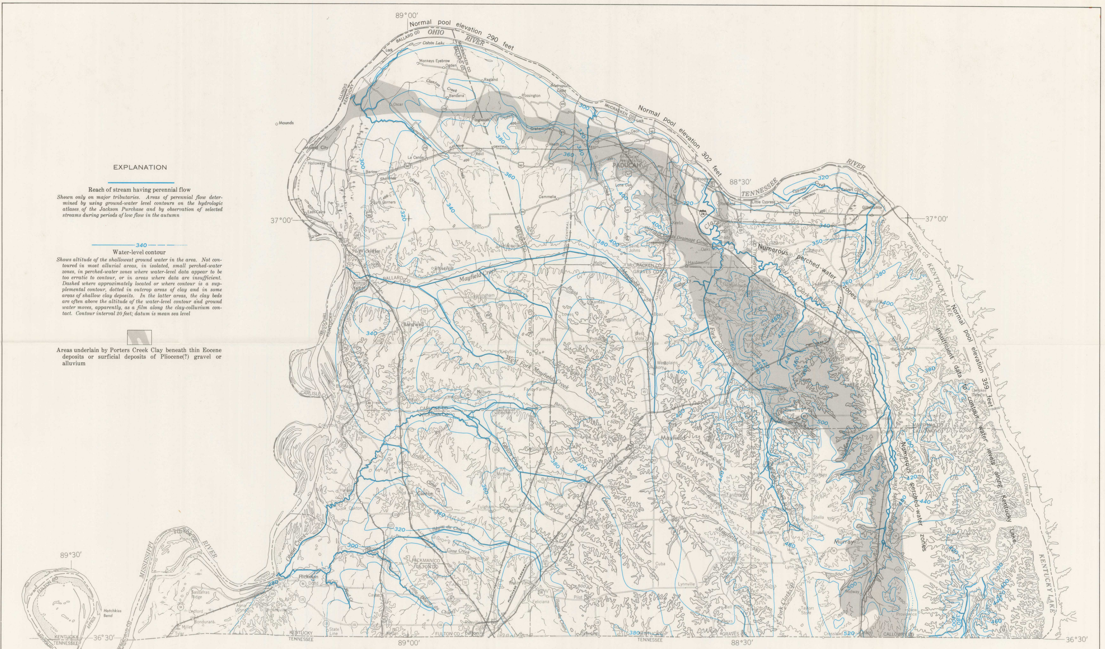
PERENNIAL STREAMS AND WATER LEVELS IN SHALLOWEST AQUIFERS